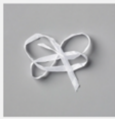
Whisper White 1/4" (6.4 Mm) Crinkled Seam Binding Ribbon [151326] € 9,25