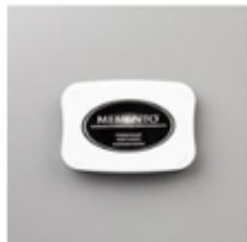
Tuxedo Black Memento Ink Pad [132708] € 7,50