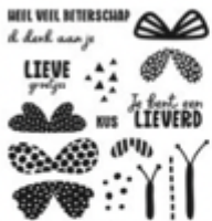
Vlinderliefde Photopolymer Stamp Set (Dutch) [160076] € 27,00