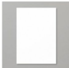
Basic White A4 Cardstock [159228] € 12,50