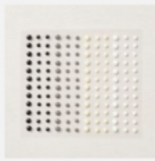
Classic Matte Dots [158146] € 8,50