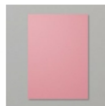
Rococo Rose A4 Cardstock [150888] € 10,50