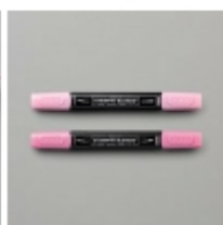
Rococo Rose Stampin' Blends Combo Pack [149572] € 11,00