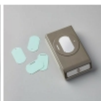
Label Me Fancy Punch [151297] € 22,00