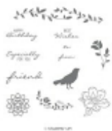
Botanical Bliss Cling-Mount Stamp Set [151284] € 23,00