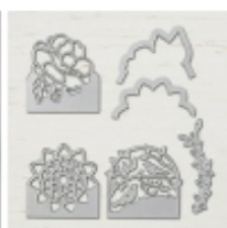
Botanical Tags Dies [146824] € 33,00