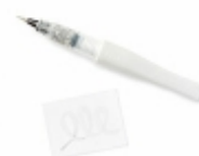
Clear Wink Of Stella Glitter Brush [141897] € 9,50