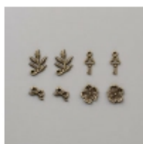
Bird Ballad Trinkets [149594] € 8,50