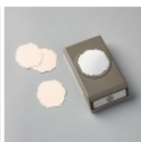
Label Me Lovely Punch [151296] € 22,00