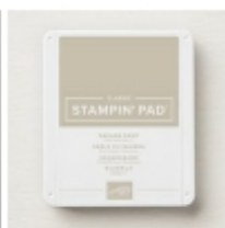
Sahara Sand Classic Stampin' Pad [147117] € 9,00