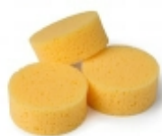
Stamping Sponges [141537] € 4,75