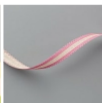
Rococo Rose 1/2" (1.5 Cm) Scalloped Linen Ribbon [149704] € 9,75