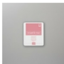
Rococo Rose Classic Stampin' Pad [150080] € 9,00